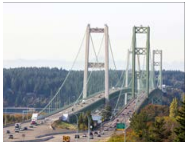
Tacoma Narrows Bridge

To obtain a copy of this report in alternative format call 360.786.6140 or for TDD 711.