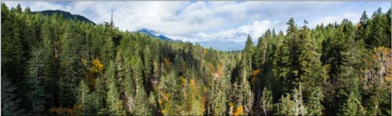
South Fork Skokomish River – High Steel Bridge