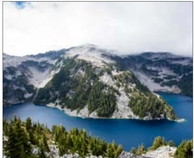
Big Heart Lake, Alpine Lakes Wilderness—near Skykomish

In terms of annual plan experience, the actual rate of investment return on the Market Value of Assets